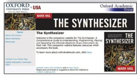
▶ Visit the companion website at www.oup.com/us/thesynthesizer